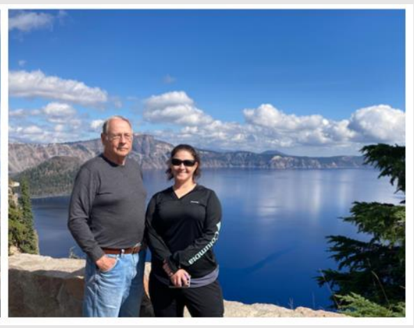
The 14th, two members headed home while the remaining seven drove south to Crater Lake National Park. Driving around the west side of the lake gave us great views, and the smoke was gone. We stayed overnight in the small town of Chiloquin about 25 miles south of the park.