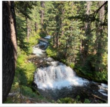
The 13th, we were on the trail at 8:30 am and made our way to the pickup at the Soda Creek Trailhead. We hiked through beautiful old growth forest and enjoyed numerous waterfalls.