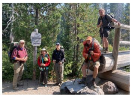
Arriving at the trailhead we were greeted by the folks who had left us on the 11th and were treated to ice cold soft drinks. Our shuttle arrived and we were back in Bend before one o'clock. A hot shower and real meat hamburgers and fries were enjoyed.