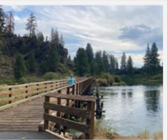
Another group saw the sights in downtown Bend. To celebrate the event, all gathered for supper in the Old Mill District after a stop in REI for fuel and last-minute supplies.