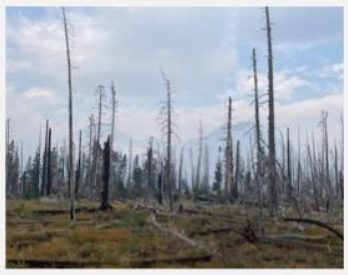
The 12th, we were on the trail again with a very light shower for a short time. The smoke was beginning to clear and we begin to get views of the east side on South and Middle Sister. We exited the burn area and enjoyed views of old growth timber and several small lakes.